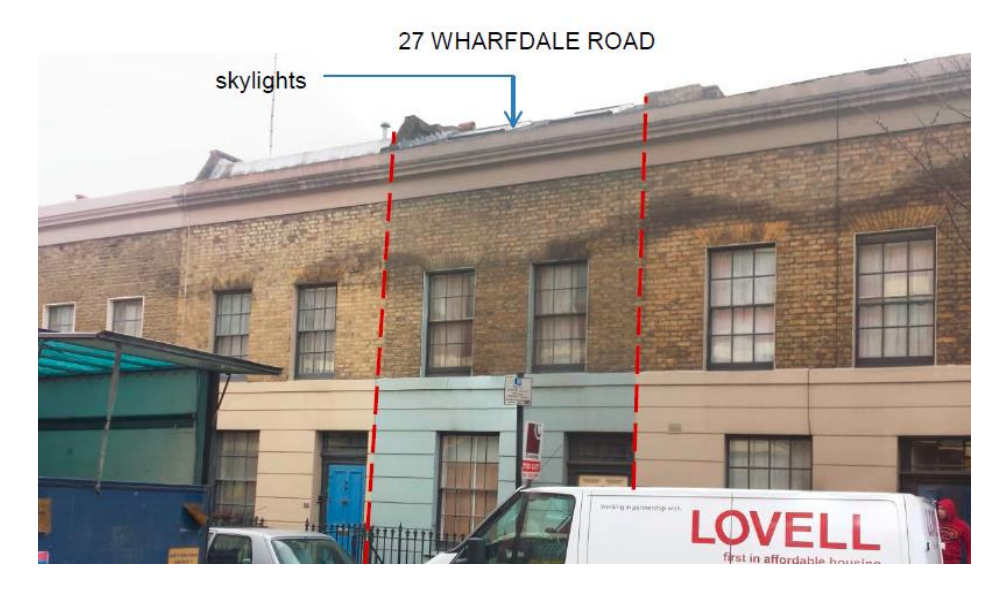
Photo 3: View taken from the submitted Design and Access Statement