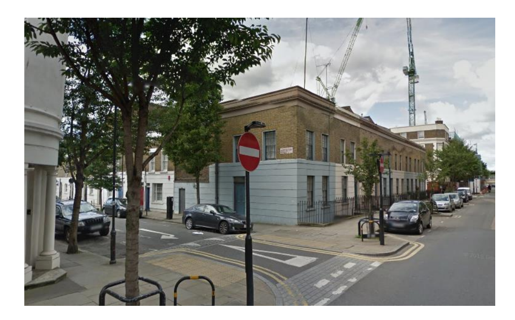
Image 2: View towards the terrace from the junction with Northampton Street